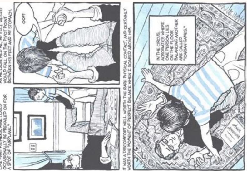
Fun home alison bechdel audiobook.